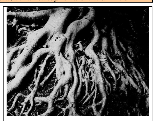
The Poisoned Root of all Evil

"The ultimate purpose of the sex faculty is a tremendously important good [new human life]; and precisely because this ultimate perfective good is not so much a good of the individual as it is good of the human race, God has attached the most vehement of all sense pleasures. Therefore to set this faculty in motion, to cull the pleasure and then positively and deliberately to prevent conception, to destroy the ultimate good